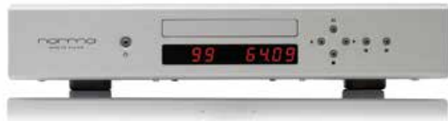
Front view – All Versions ( Red display )

Thanks to the versatility and modularity of Norma products, the REVO line sources are available in three different versions. The REVO DS-1 offers the largest possibilities, combining Digital Sources with CD Mechanism. The REVO CDP-1BR is only fitted with CD Mechanism (No Digital Connections). The REVO DAC-1 is only fitted with Digital Connections (No CD Mechanism).