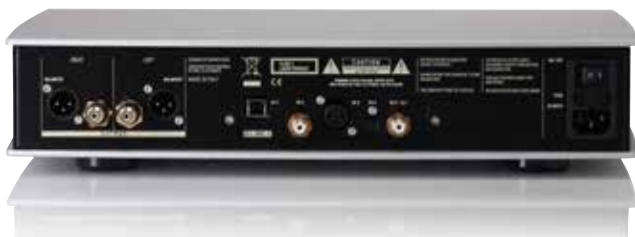
Rear view – REVO DS-1 and REVO DAC-1

Thanks to the versatility and modularity of Norma products, the REVO line sources are available in three different versions. The REVO DS-1 offers the largest possibilities, combining Digital Sources with CD Mechanism. The REVO CDP-1BR is only fitted with CD Mechanism (No Digital Connections). The REVO DAC-1 is only fitted with Digital Connections (No CD Mechanism).