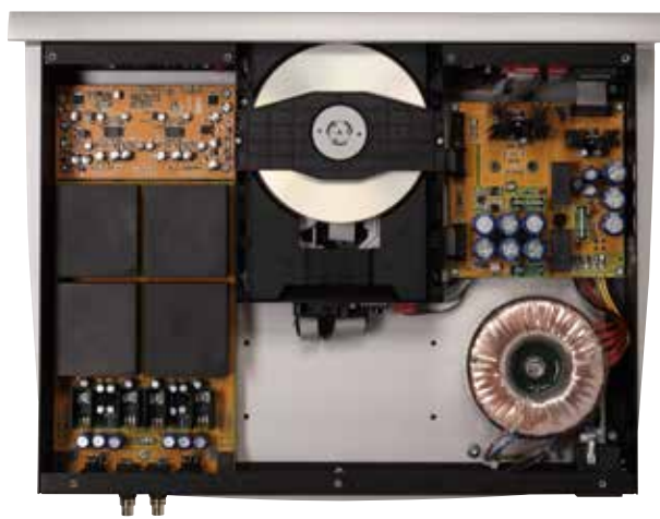
Top view – REVO CDP-1BR