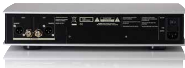
Rear view – REVO CDP-1BR