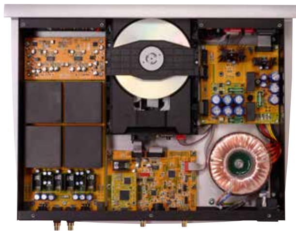
Top view – REVO DS-1